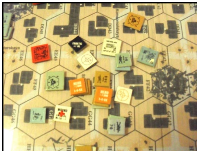
The defiant Russians desperately attempt to hold off the German assault.

a solid reverse slope defence. I used the turret counter sleaze last time I played it – obscuring the defending tanks so you can't tell which ones are the Fireflies. Legal advice has since outlawed this – but the great thing about sleazes is that there are so many to choose from. No one would be examining the barrel lengths of my Shermans – not with those HS and SMC riders. Why yes I'm sure if you're involved in a desperate defence against SS, the back of a tank is a perfectly sensible place to be. Someone has to ehrrm...liaise...and do...err...coordination and stuff.