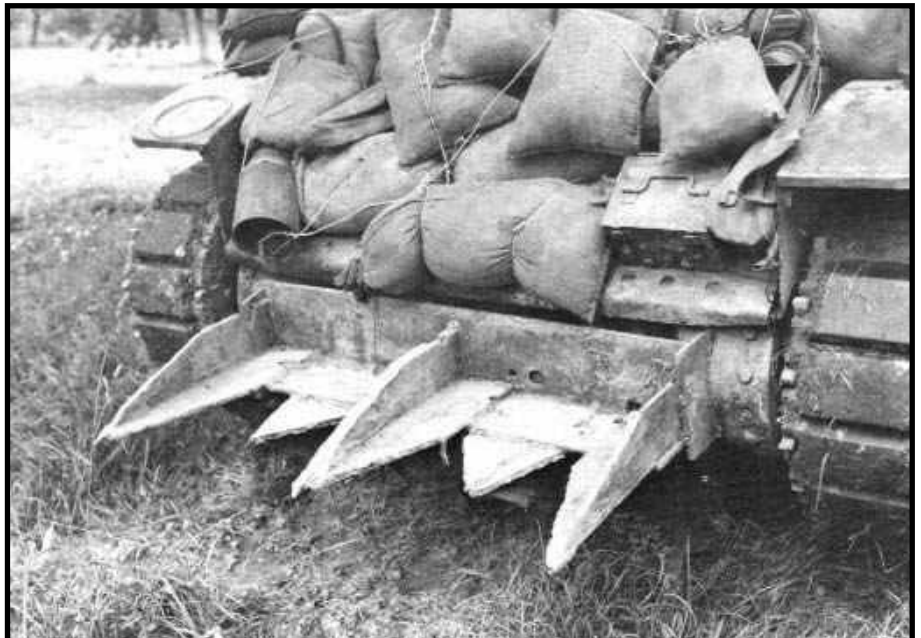
The Culin device, one of many implements devised in the bocage to get through the hedgerows.

Perhaps the crux of the morale issue is the least tangible and hardest to source accurately; the GI was the least warlike compared to the Europeans because he had the least to lose. His home was farthest from the fighting. The Italians on Sicily were defending their own soil; the Germans in Normandy were fighting a last ditch defence of what by 1944 had become a way of life to them. The Romanians and Hungarians and various factions of the Yugoslavians all had bitter old scores to settle with each other. The American soldier was for the most part eager to shed his olive