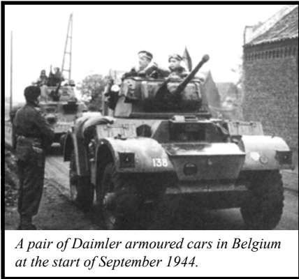
A pair of Daimler armoured cars in Belgium at the start of September 1944.

be the same as the unbroken side. However, the Belgian player is not eligible to receive any Belgian AFV: any AFV received must be rolled for on the British SASL tables. The Belgian player is also eligible to receive a British Ally.