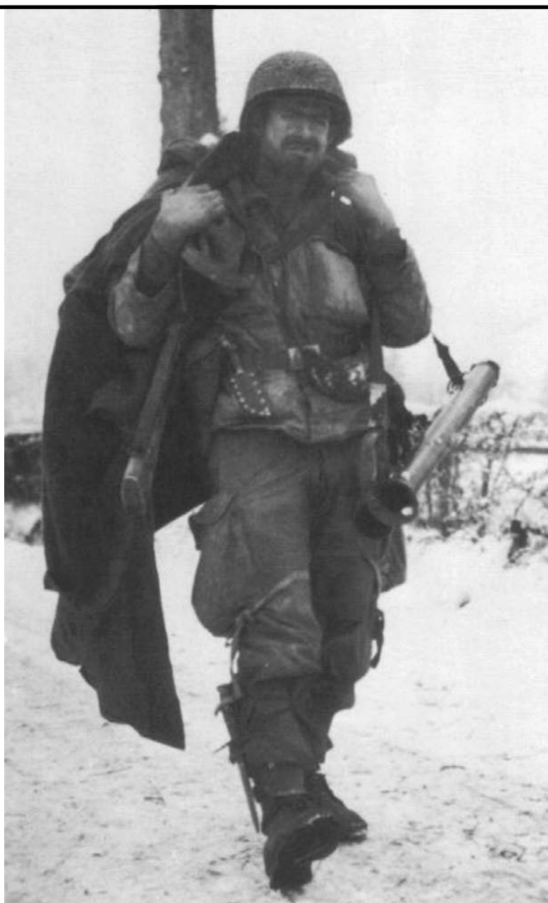
Famous photo of an 82nd Airborne trooper in the winter of 1944-45 (in fact, it was used on the cover of Close Assault). The Canadians who relieved the 82nd in the Nijmegen Salient thought the Americans “looked cold.”